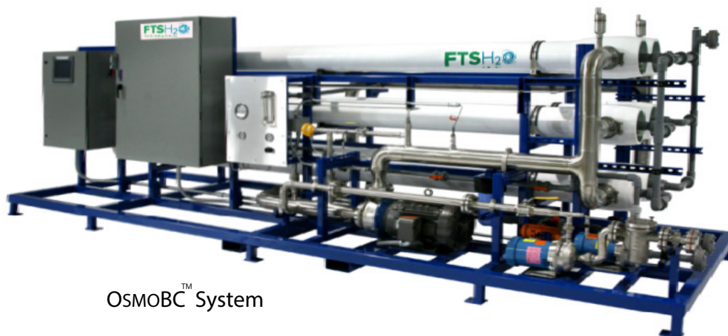
OsmoBC TM System

INTEGRATED FILTRATION SYSTEMS FOR INDUSTRIAL APPLICATIONS